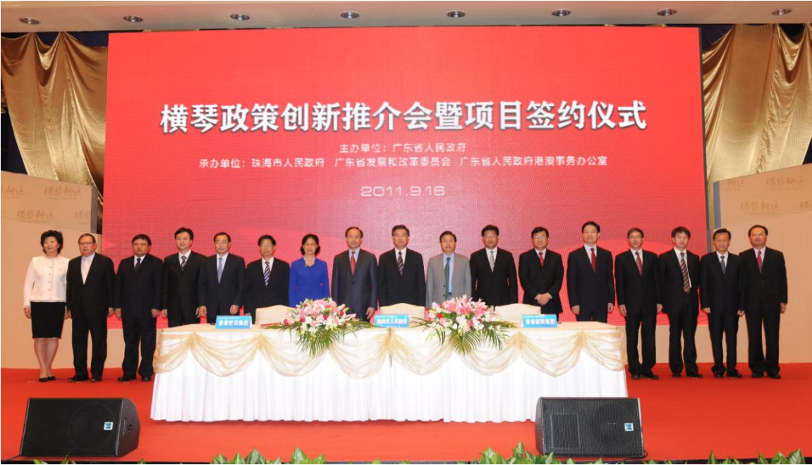
Government officials together with representatives from the participating companies